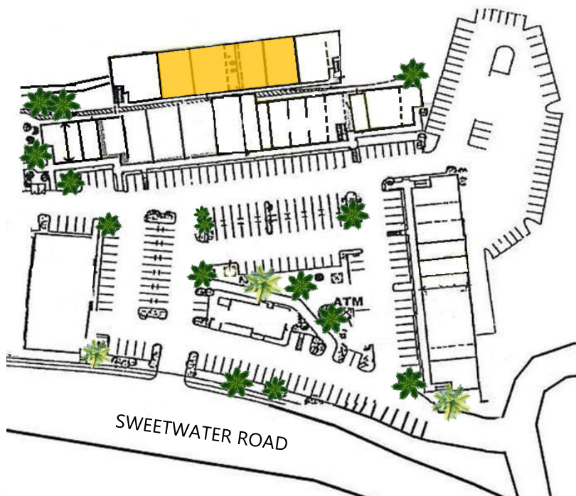
Site plan is not to scale; for reference purposes only